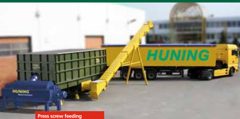
Press screw feeding